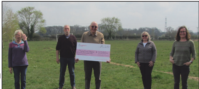
Chairman and working group with the National Lottery Community Fund award cheque

Once again thanks to all the charities that have so far contributed to this scheme and to the efforts of the working group, the support of the parish council and encouragement of many residents.