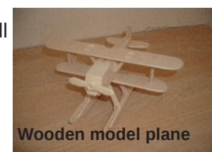
Wooden model plane