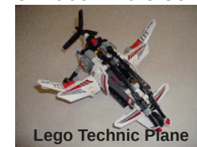
Lego Technic Plane