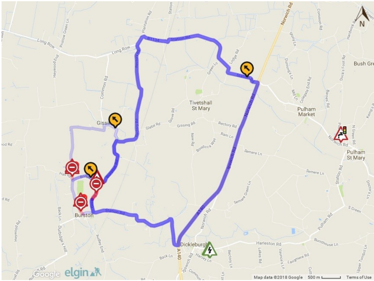
Burston & Shimpling STRO1519 HM