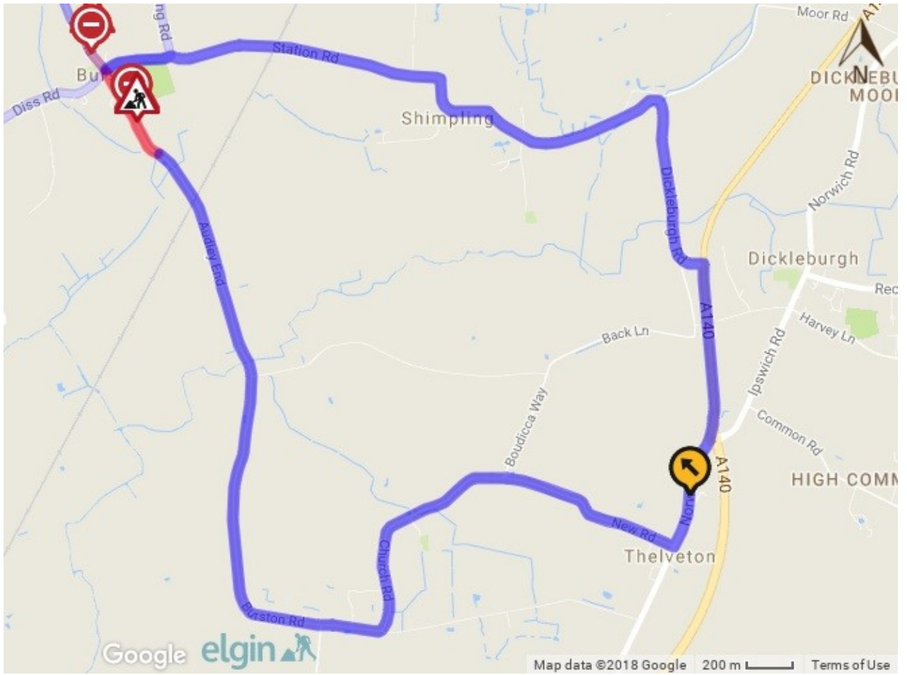
Burston and Shimpling STRO1475 PT