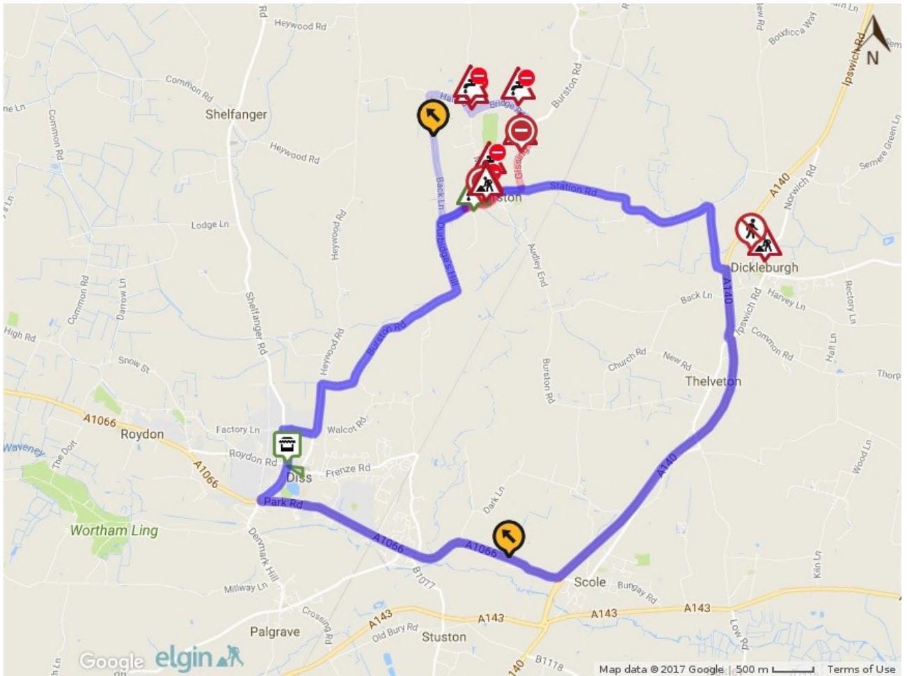
Burston & Shimpling STRO1080 Continuation HM